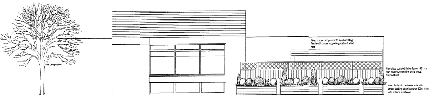
LHS SIDE ELEVATION AS PROPOSED